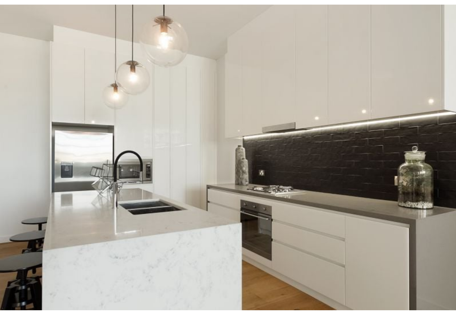
707/46 Riley Street, Woolloomooloo