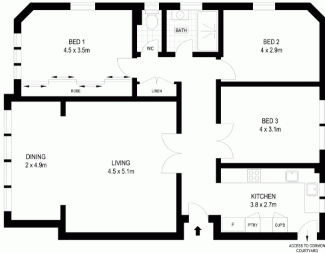
ELEVATED GROUND FLOOR