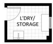
(NOT ACTUAL LOCATION)