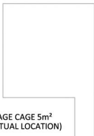
STORAGE CAGE 5m 2 (NOT ACTUAL LOCATION)